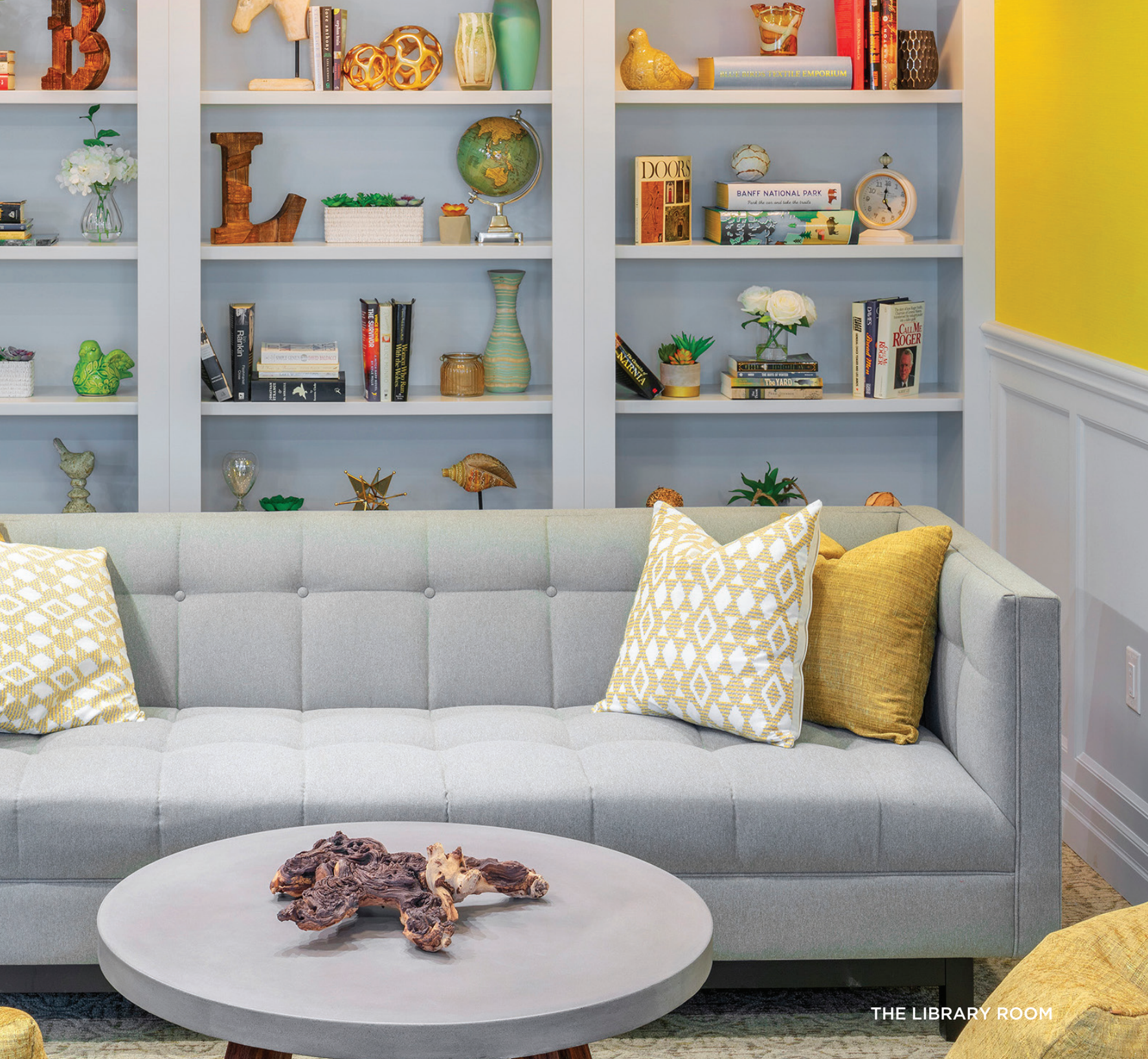
THE LIBRARY ROOM