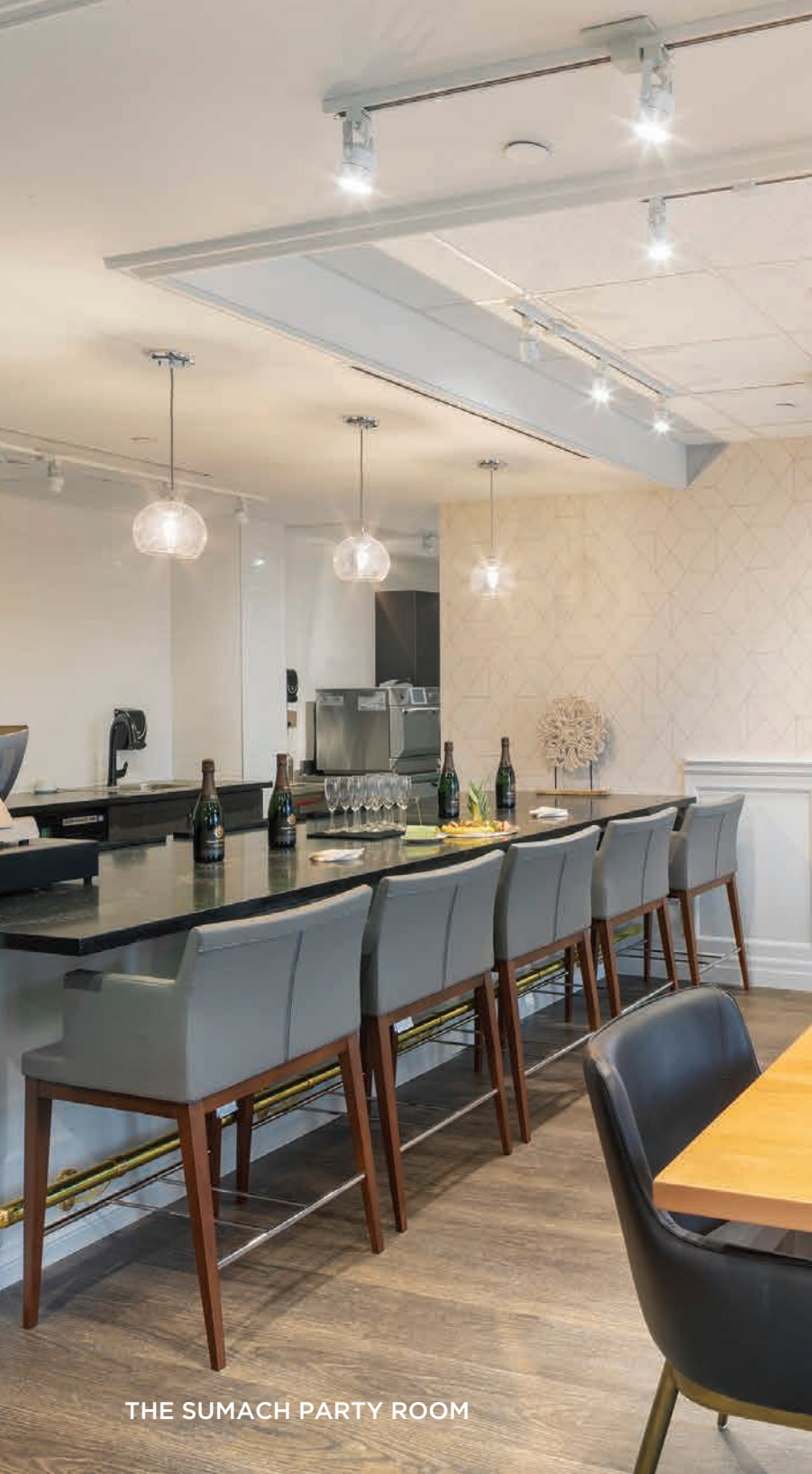
THE SUMACH PARTY ROOM

Find your own special place in one of The Sumach's many amenities, designed with you in mind. The billiards lounge is where you'll get in touch with your fun side.