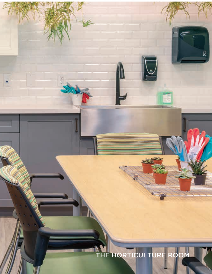
THE HORTICULTURE ROOM